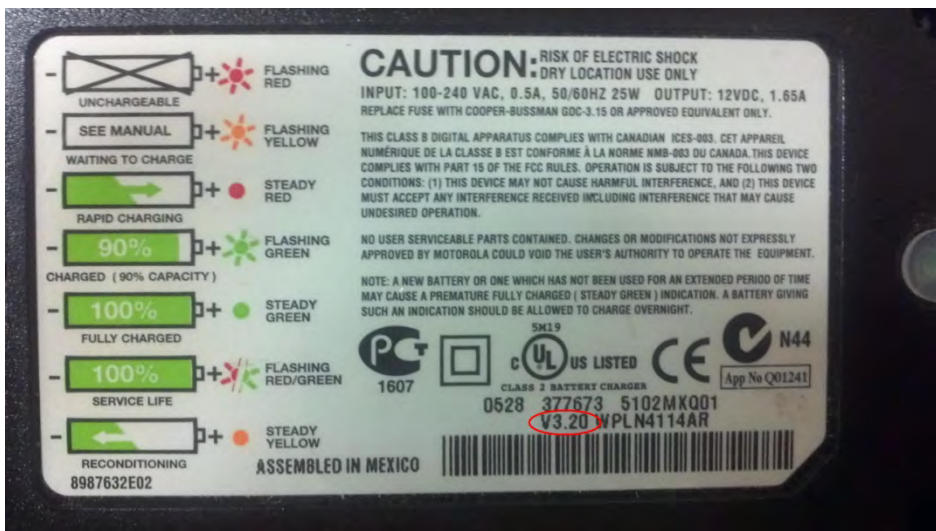
Figure 2: XTS Single Unit charger

MOTOROLA Solutions and the Stylized M Logo are registered in the U.S. Patent & Trademark Office. All other product or service names are the property of their respective owners.