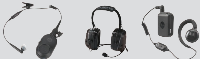
NNTN8294 (Wireless Pod not included)

Wireless accessories give you the flexibility to remove the radio from your belt and stay connected within 30 feet. We've embedded Bluetooth in to your XPR 7000 Series radio so no adapter is needed. A full portfolio of wireless accessories are available to meet your specific business needs. The XBT Heavy-Duty Wireless Headset is the state-of-the-art digital headset that unleashes the power of MOTOTRBO radios to shield you from harmful, high-decibel noise while letting you hear the sounds you need to – people, alarms, alerts and more.